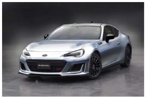
SUBARU BRZ STI Sport Concept