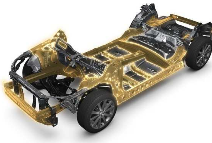
The Subaru Global Platform