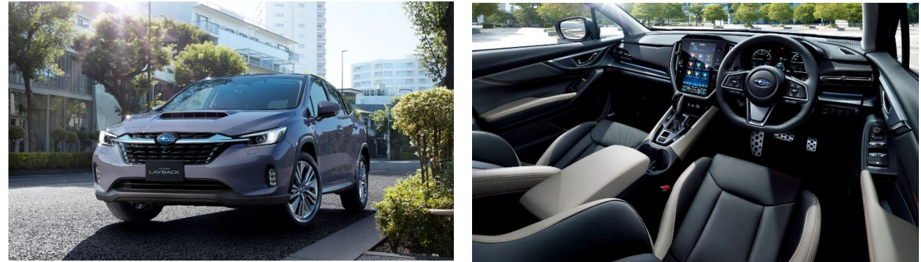
Levorg Layback Limited EX (Japanese specification model)

The all-new Levorg Layback combines the three values of Levorg, advanced safety, sportiness, and value as wagon, with the flexibility as SUV and high quality. It is developed for the Japanese market as a unique SUV in Subaru's extensive SUV lineup.