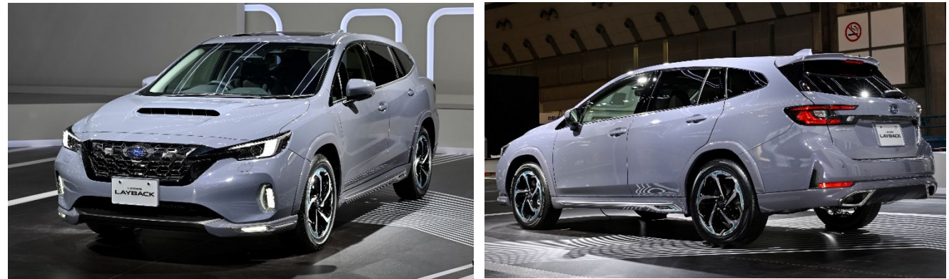
Levorg Layback Limited EX Genuine Accessory Parts equipped model (Japanese specification model)

• Levorg Layback Limited EX Genuine Accessory Parts equipped model (Japanese specification model)