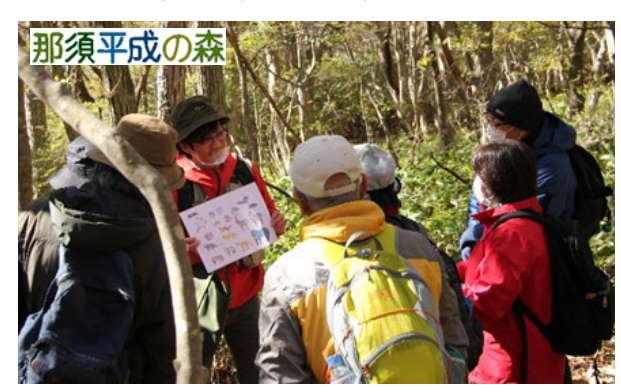
Nasu Heisei-no-mori Forest at Nikko National Park (Scene of activities by the interpreters<sup>*3</sup>)