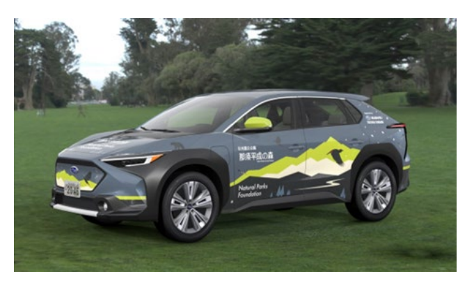
Nasu Heisei-no-mori Forest patrol car (Solttera, image)

With our background of having an aircraft making DNA, Subaru places the highest priority on safety in "People-Centered Monozukuri (Manufacturing)" and holds "Protection of Life" to be important. Based on the idea of "Protection of Life" as the core of activities, Subaru will engage in the "Cherishing Every Life Project" as an initiative to be carried out together with customers, dealers, Subaru and local residents. "Human life" is irreplaceable and "natural life" takes care of rich forests and wildlife. We will continue to support those who are working to "protect and pass those on to a future full of smiles".