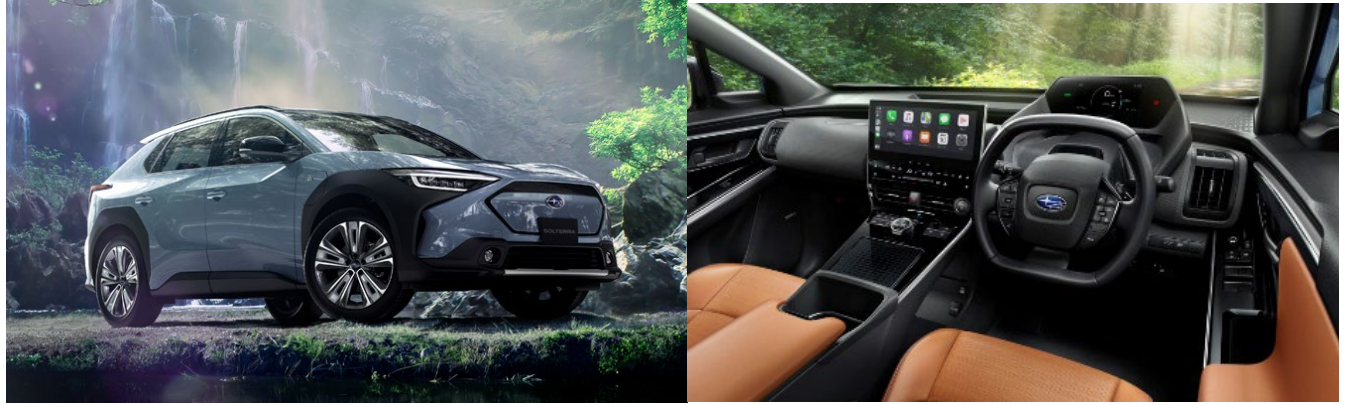
Solterra ET-HS (Japanese specification model)

Solterra ET-HS Updated model (Japanese specification model)