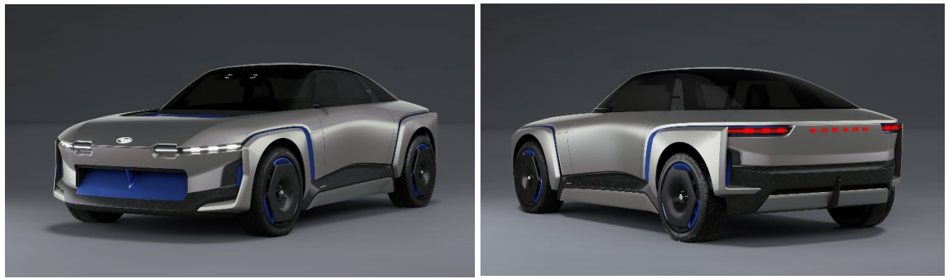
SUBARU SPORT MOBILITY Concept

This concept model expresses the enjoyment that Subaru offers in the age of electrification, embodying the pleasure of going anywhere, anytime, and driving at will in everyday to extraordinary environments. Driving with peace of mind allows us to embark on exciting new adventures. This is a battery electric vehicle (BEV) concept that evokes the evolution of the SUBARU SPORT values.