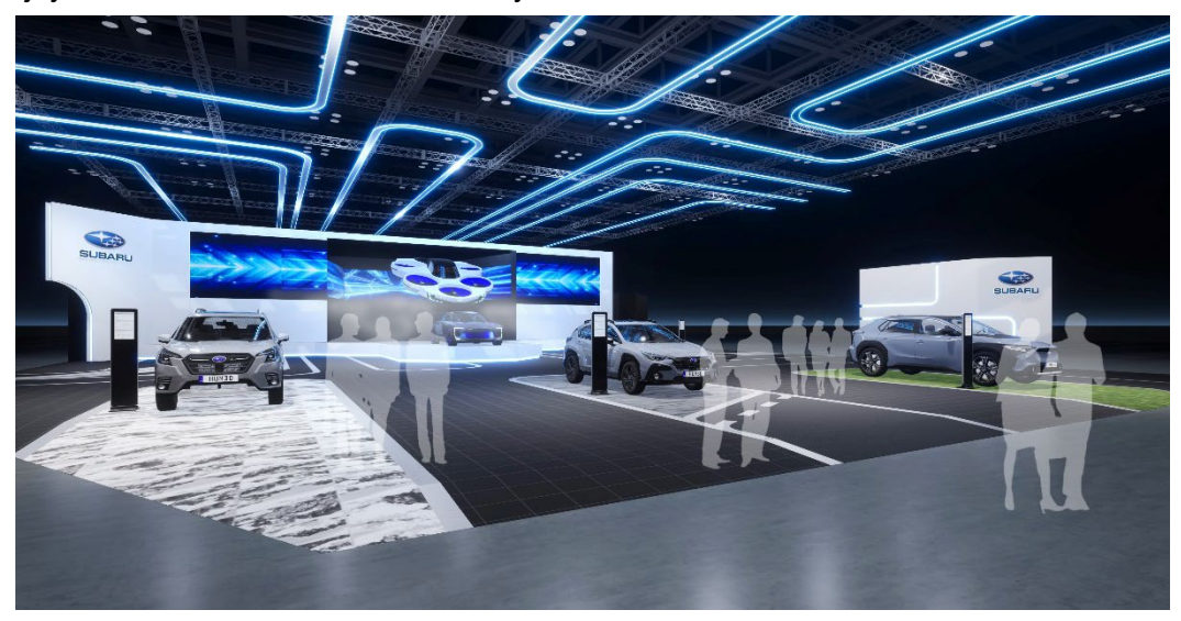
Subaru Booth Rendering

Tokyo, October 25, 2023 – Subaru Corporation has started its exhibition at the JAPAN MOBILITY SHOW 2023 (Press Days: October 25–26, Public Days: October 27–November 5, 2023). The Subaru booth showcases Subaru's vision of future mobility and communicates Subaru's efforts to strengthen its bond with society, allowing visitors to experience "Enjoyment and Peace of Mind" for today and the future.