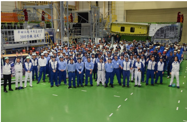
3,000th Center Wing Box Ceremony

Subaru will continue to strive to further enhance its technologies by always putting quality and safety first, and to provide aircraft systems including total aircraft support such as maintenance and training to our customers in addition to developing and manufacturing aircraft components.