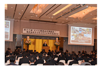
"General Cooperation Meeting" for the Automotive Business suppliers

In an effort to share with suppliers our mid- to long-term management strategies and our quality, procurement, production and sales policies, Subaru has been hosting "Policy Briefings" every spring, and have had 700 people from 400 companies participating in the Briefings. Subaru also periodically exchanges information by participating in "Cooperation Meetings" comprised of our suppliers. Once a year, Subaru awards those that have particularly contributed to R&D, production, and quality improvement.