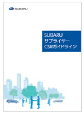
SUBARU Supplier CSR Guidelines

* Conflict minerals: Minerals produced as a source of funding for the activities of armed insurgents in the Democratic Republic of the Congo and surrounding countries.