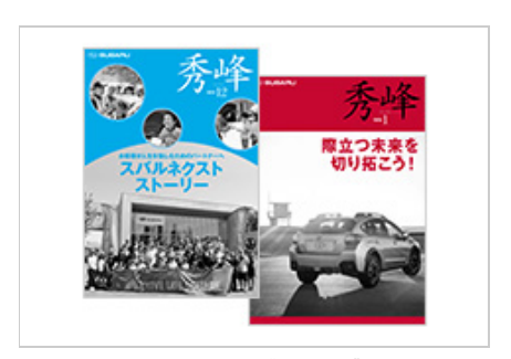
In-house magazine "Shuho"

FHI also has a means to promote direct communication with employees through periodical visits by management to each place of business and workplace.