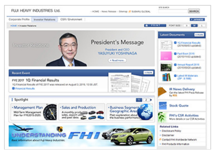
Webpage "Investor Relations"