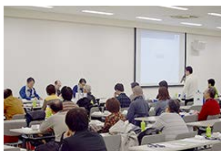
Plant tour for shareholders in FY2016