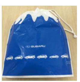
Original garbage bags that we distributed