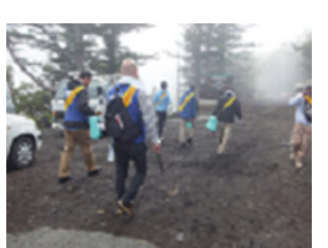
Clean up activities

Going forward, we will continue to work on this program as one of the core components of FHI's social contribution activities.