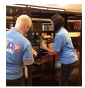
SOA employees help to stock food