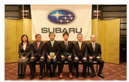
The two employees who received the award (third and fourth from the left) and FHI officers

As a specific example, an award system to honor employees who contribute to the community and society by actively volunteering was established in 2006. The 11th award ceremony was held in June 2016 and two employees were honored with the volunteer award.