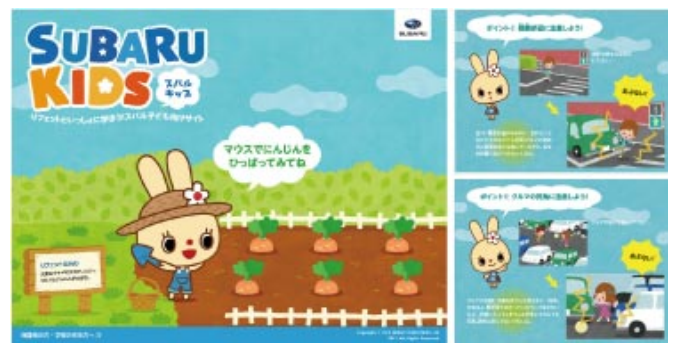
"SUBARU Kids" site for children (Available only in Japanese)

As a member of the traffic society we actively promote awareness among employees at each of our offices and plants by providing accident prevention meetings before long holiday seasons and other occasions.