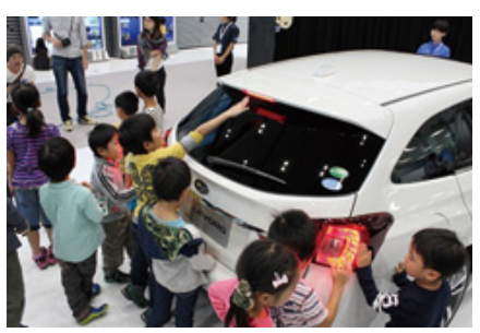
Road safety class

In October 2015, we held the Subaru Road Safety Workshop at STAR SQUARE, our headquarters' showroom. The objective of the event was to deepen road safety awareness among children in the lower grades of elementary school. On the day, we ran a picture card video and four hands-on programs to make learning important points about safety fun.