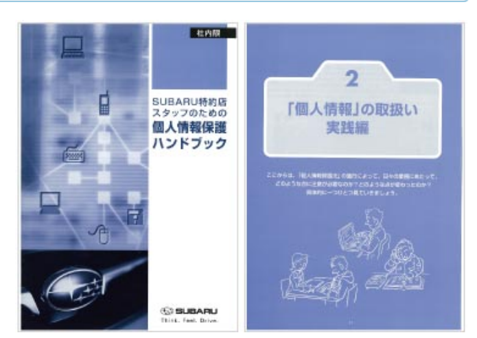
Handbook for SUBARU Dealer Staff

Since Subaru dealers in Japan handle a wide range of customer information, we have reviewed the compliance of each of the 44 dealers, including affiliated companies, with our rules and created a Personal Information Protection Handbook for Subaru Dealers. In this way, we are working to ensure that all employees understand the importance of protecting personal information.