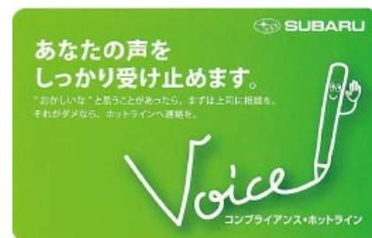
Compliance Hotline Card