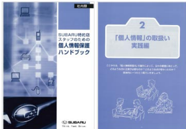
Handbook for SUBARU Dealer Staff

Since Subaru dealers in Japan handle a wide range of customer information, we have reviewed the compliance of each of the 44 dealers, including affiliated companies, with our rules and created a Personal Information Protection Handbook for Subaru Dealers. In this way, we are working to ensure that all employees understand the importance of protecting personal information.