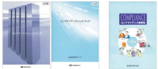
Left: Compliance Handbook for Affiliated Companies Right: 100 Case Studies of Compliance Issues

We also prepare and provide various support tools, including ones specially intended for affiliated companies and domestic SUBARU dealers, to promote compliance in day-to-day operations. Urgent information is released on a timely basis in our "Compliance Information" to alert the entire group.