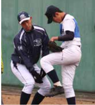
November: Gunma High School Baseball Federation Baseball

The Gunma High School Baseball Federation held a baseball class. Altogether 177 students from 33 schools in Gunma prefecture took part. The company's baseball team members were invited as instructors to help improve the level of high school baseball in Gunma prefecture. The day of the class began with a warm-up at 9 AM, followed by a session of catch ball, a knock demonstration, training per position and so on; and despite the cold weather, the high school students paid keen attention to the guidance they were given.