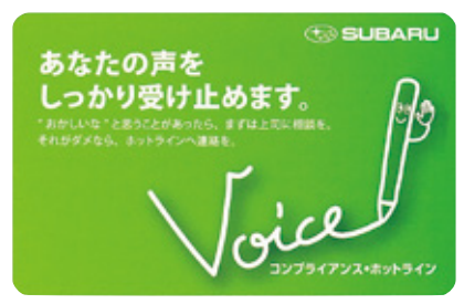
Compliance Hotline Card