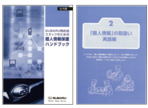
Handbook for SUBARU Dealer Staff

To comply with the Personal Information Protection Act, FHI has reviewed its internal systems and rules and publicly disclosed its privacy policy. Since Subaru dealers in Japan handle a wide range of customer information, we have reviewed each dealer's compliance with our rules and created a Personal Information Protection Handbook for Subaru Dealers. In this way, we are working to ensure that all employees understand the importance of protecting personal information.