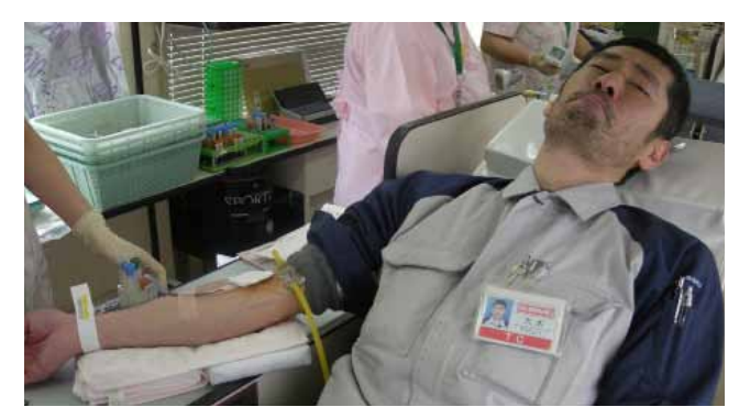
February 2011: On-Site Blood Donation in Tokyo Office Within the premises of Tokyo Office, a blood donation session was organized by the Japanese Red Cross Tokyo Metropolitan Blood Center. A total of 78 employees donated their blood, particularly appreciated by those who do not often have such an opportunity.

November 2011: 10th Motorcycle Traffic Safety Training In cooperation with the Mitaka Police, we held traffic safety training for motorcycle riders to promote accident prevention. Thirteen attendants listened keenly to the motorcycle officer' s instructions and guidance.