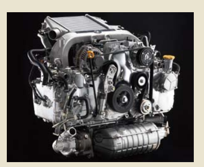
Boxer Diesel Engine for Passenger Cars

The CO<sub>2</sub> emission of 148 g/km of the AWD Sedan represents a top fuel economy in the class. Subaru cars with the boxer diesel engine are highly evaluated in the European market where diesel-powered models have a high market share.