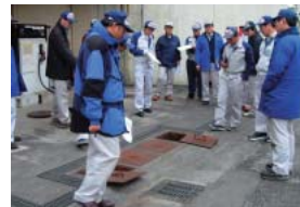
Practice drills to prepare for potential environmental accidents

Also since fiscal 2004, as one of our contributions to local communities, we have conducted office tours for elementary school children. In fiscal 2006, five elementary schools (410 fifth-grade students) from the local communities visited our office.