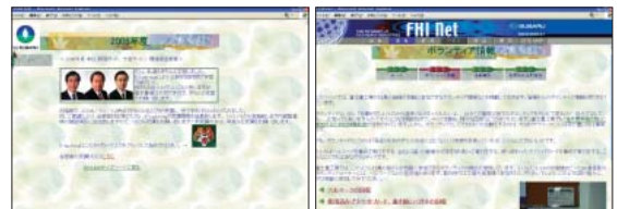
The intranet page for environmental education The intranet page for volunteer activity information

Through our active involvement in volunteer activities, a "volunteer information" page was developed on our intranet system to introduce volunteer activities that employees can easily participate in.