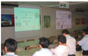
Environment Improvement Case Study Presentations