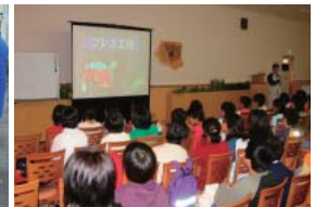
Contributing to local communities, elementary school students are taken for tours around the Tokyo office.