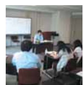
Internal Compliance Training

*1 : The Board of Directors Meeting consists of 6 executives. The board of Corporate Auditors Meeting consists of 4 auditors, including two outside corporate auditors, to observe the corporate management objectively (as of May 31, 2006).