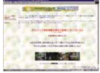
FHI intranet has a homepage dedicated to provide volunteering activities to employees