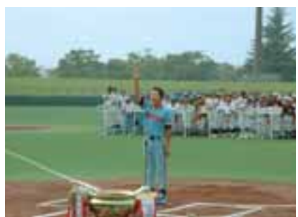
Subaru Cup rubber-ball Baseball Tournament for Children