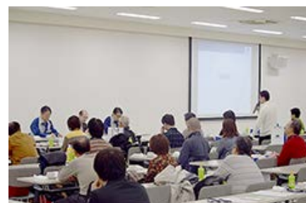
Plant tour for shareholders in FY2016