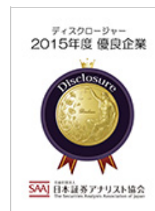
Logo of the Awards for Excellence in Corporate Disclosure

FHI was placed first in the Automobile/Parts/Tires industry area by The Securities Analysts Association of Japan in its FY2016 Awards for Excellence in Corporate Disclosure. It was the second year in a row that we received this award. We ranked highly, placing first out of 20 companies in our industry area in four of the five evaluation categories.