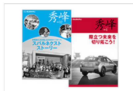
In-house magazine "Shuho"

FHI also has a means to promote direct communication with employees through periodical visits by management to each place of business and workplace.