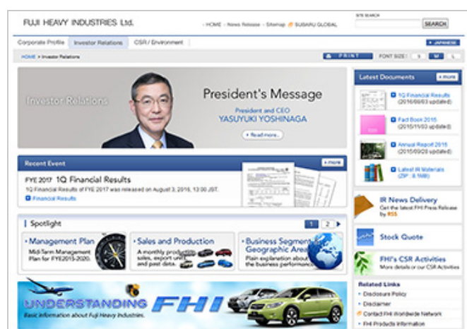
Webpage "Investor Relations"

We also offer an IR newsletter service to distribute the latest IR information such as settlement details by email to those who register. Approximately 1,300 people are currently registered for the free IR newsletter service.