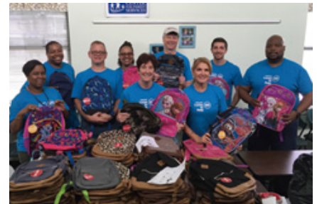
Employees packing more than 2,000 backpacks with books and school supplies

In August 2015, SOA headquarters and employees from each of its business sites along with Subaru retailers donated more than 16,000 children's books and school supplies to more than 200 schools across the United States.