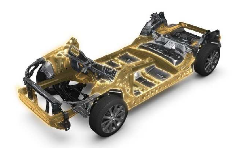
The Subaru Global Platform