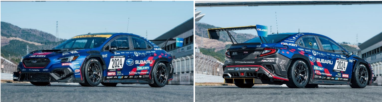
SUBARU WRX NBR CHALLENGE 2024

Tokyo, May 17, 2024 – Subaru Tecnica International *1 , Subaru's motorsport subsidiary, will compete in the 52nd Nürburgring 24-Hour Race from 30 May to 2 June 2024 at the Nürburgring circuit in the Eifel region of Rhineland-Palatinate, Germany with its WRX S4-based race car. This marks Subaru's 15th *2 participation in the Nürburgring 24h race since its debut in 2008.